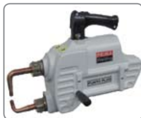
The X gun is available with 20mm cap electrodes or 13mm.

An attachment DPC can be fitted to the X gun to convert to C gun.