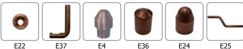
E22 E37 E4 E36 E24 E25